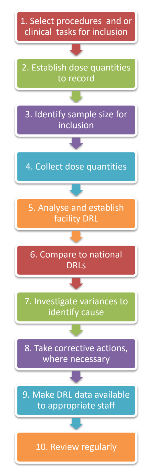
Figure 1. DRL process