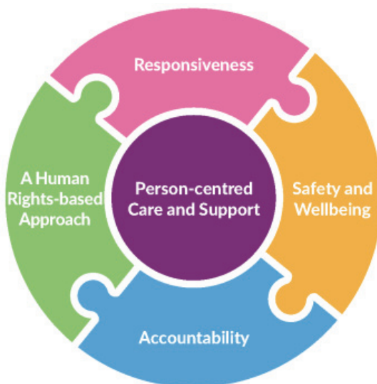
Principles to underpin national standards for health and social care services.

Under the Health Act 2007, HIQA is responsible for the development of national standards for health and social care services. National standards are a set of high-level outcomes that describe how services can achieve safe, quality, person-centred care and support. National standards aim to promote quality improvements and improve the experience of people using health and social care services. Principles have been developed that underpin all national standards. The principles are: responsiveness, a human rights-based approach, safety and wellbeing, and accountability, which work together to ensure person-centred care and support.