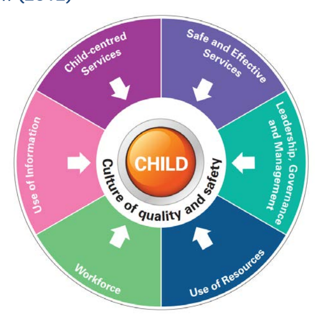
Figure 1. Themes in the National Standards for the Protection and Welfare of Children (2012)

The national standards are grouped into six areas called 'themes' as illustrated below in Figure 1. Under each theme, the 'standard statement' describes what a good service looks like and what this means for the child. Underneath these are 'features' which give examples of how the standard may be met. See Figure 2. However, providers are free to achieve the national standards in other ways.