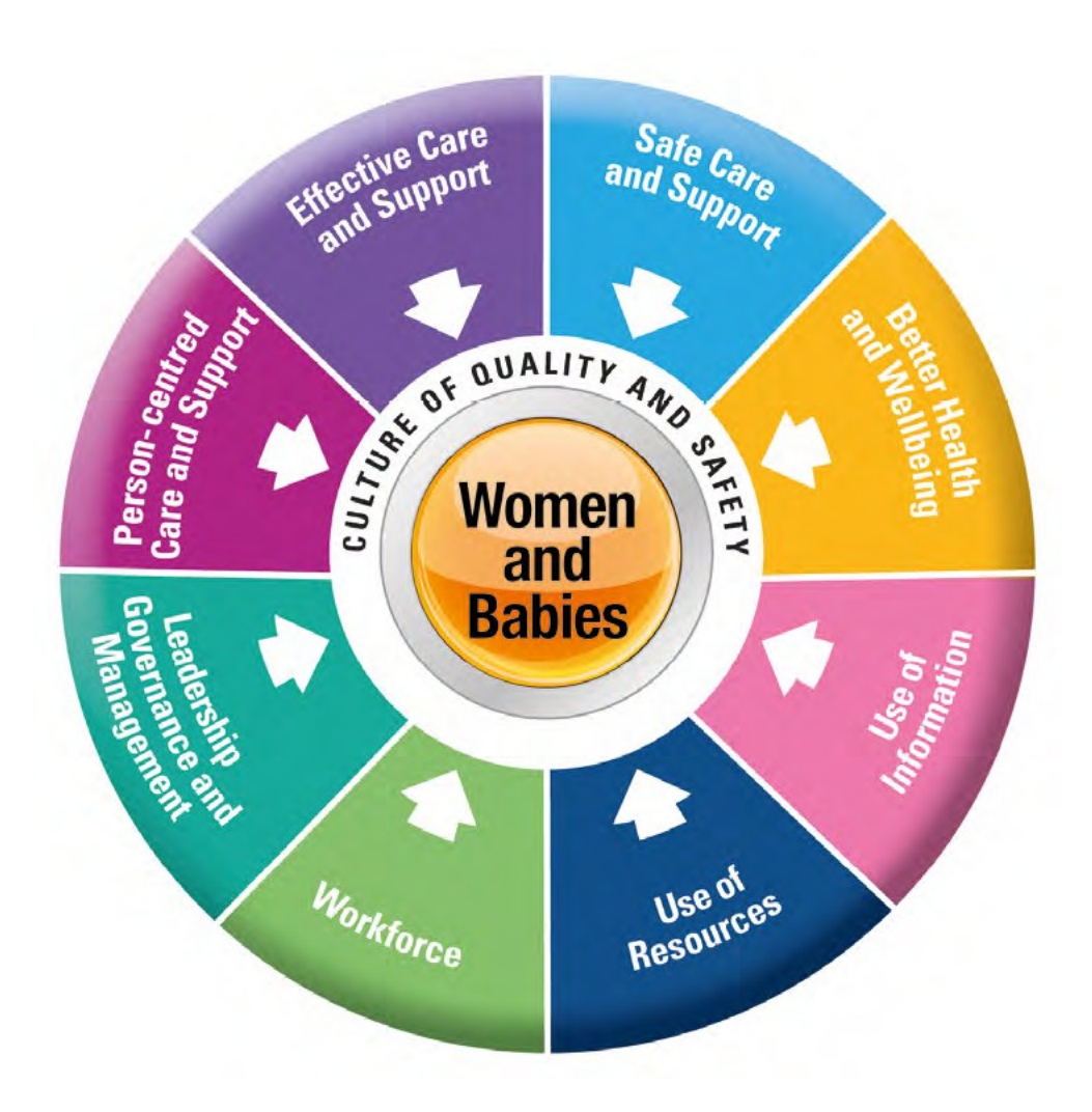
Figure 1. Themes for safety and quality

The four dimensions of safety and quality are: