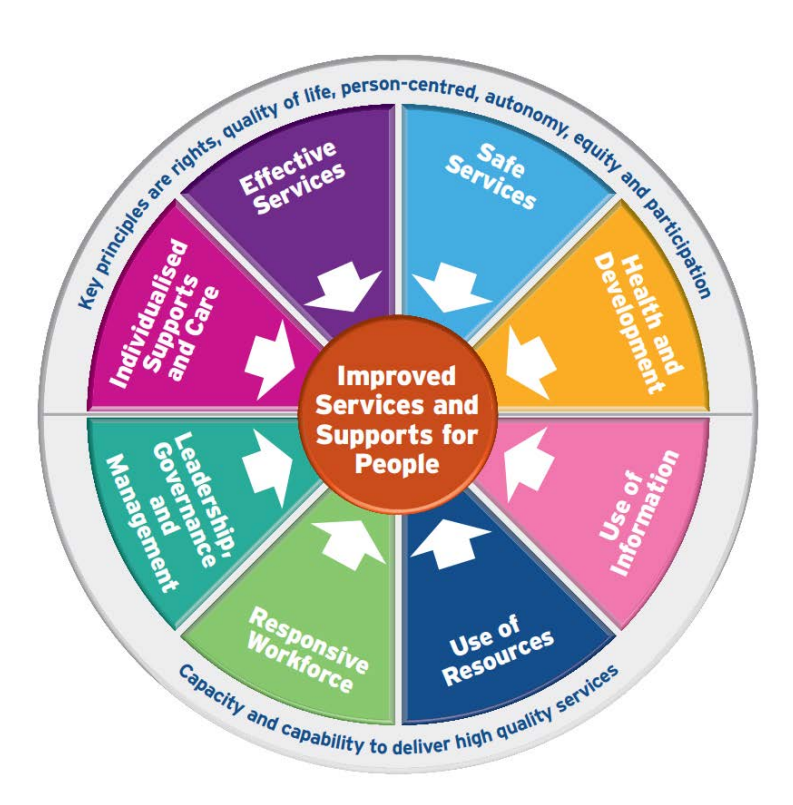
Figure 1: Themes in the standards

Each section is made up of four themes which are set out in full in the standards which are available on our website, <u>www.hiqa.ie</u>. The standards are then written against each theme.