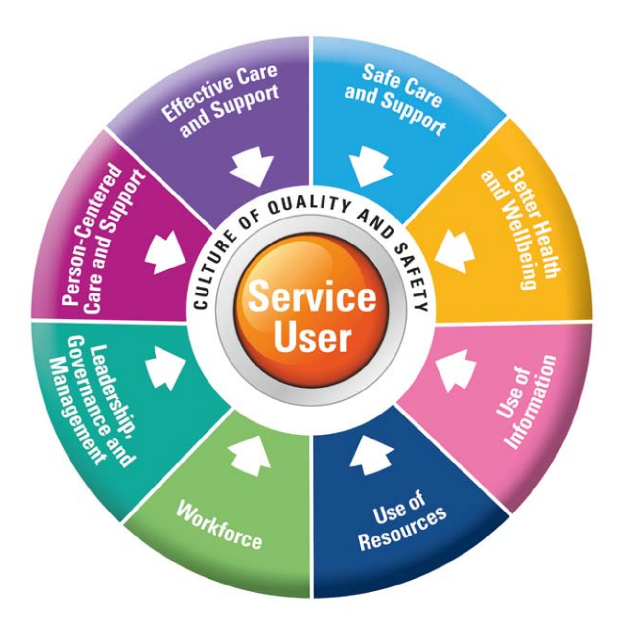
Figure 1: Themes for Quality and Safety

As Figure 1 illustrates, the eight themes are intended to work together. Collectively, they describe how a service provides high quality, safe and reliable care centred on the service user. The four themes on the upper half of the figure, relate to dimensions of quality and safety and the four on the lower half of the figure, relate to key areas of capacity and capability.